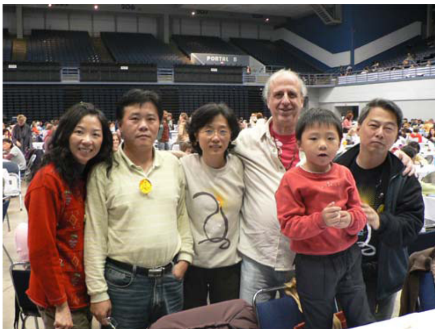
Support for a little Wizard 大家來鼓勵小巫師