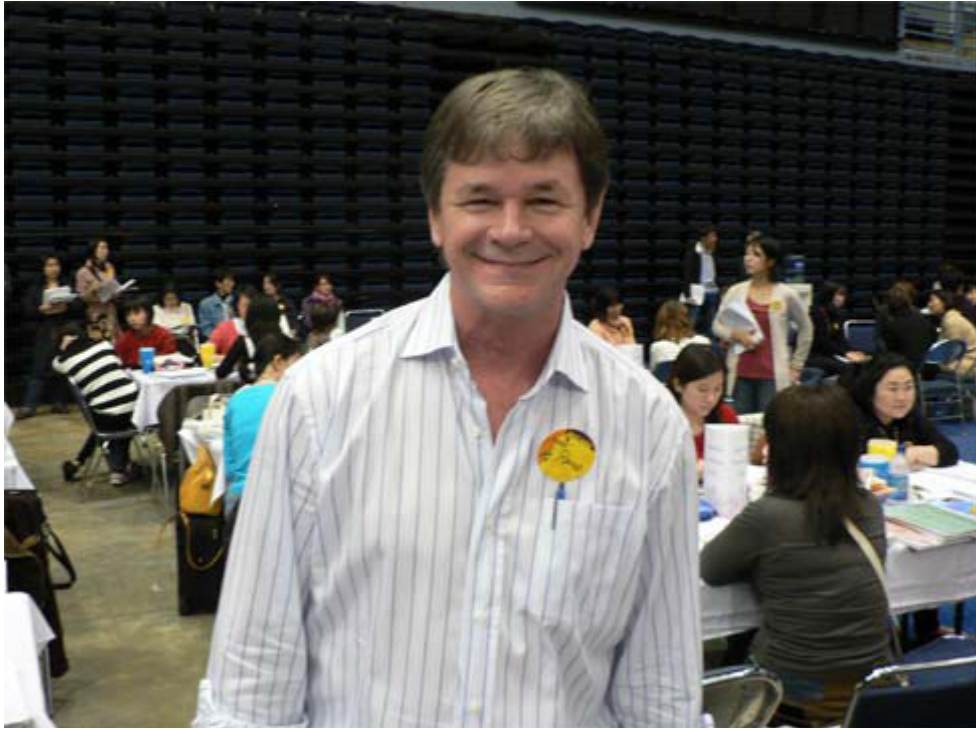
The grin of a California Wizard. 看到這種笑容時可以確定他是加州來的