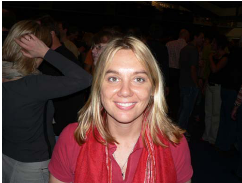
Sunshine from Australia. 澳洲陽光