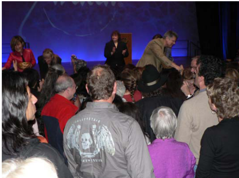
Trainers congratulate new Wizards on their breakthroughs. 訓練師慶祝新智者的突破