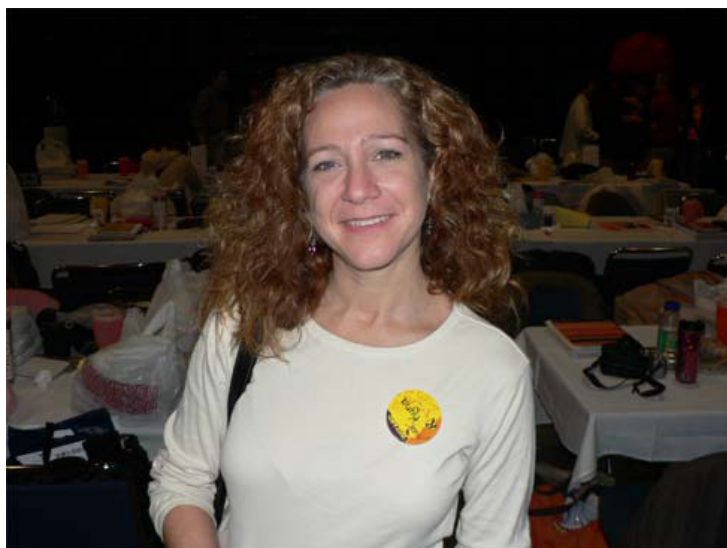
Ahm from Texas, yall.