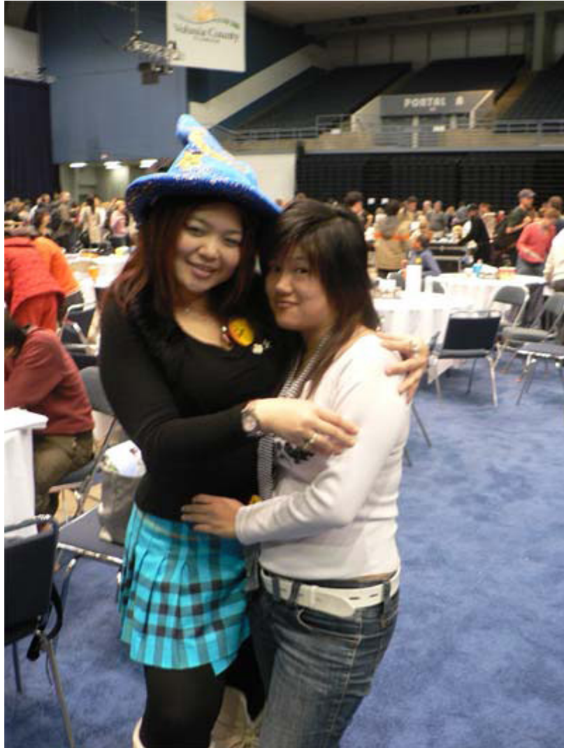
You've got the Magic Touch! 妳擁有那魔法式的點醒功夫