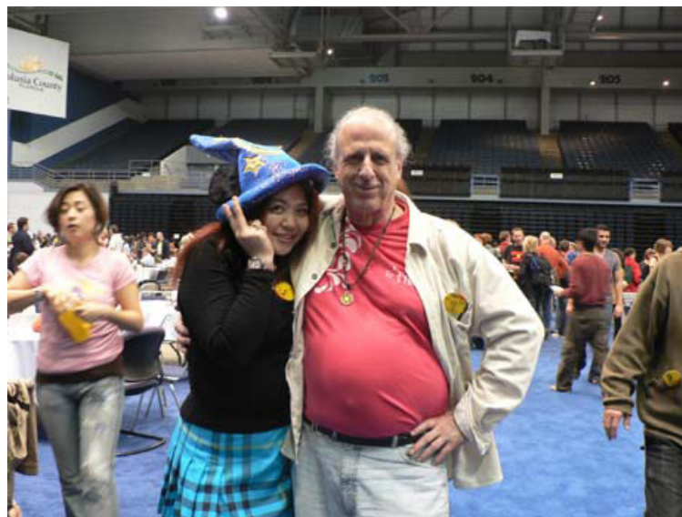
My hat won't fall off! 我的帽子不會掉下來！