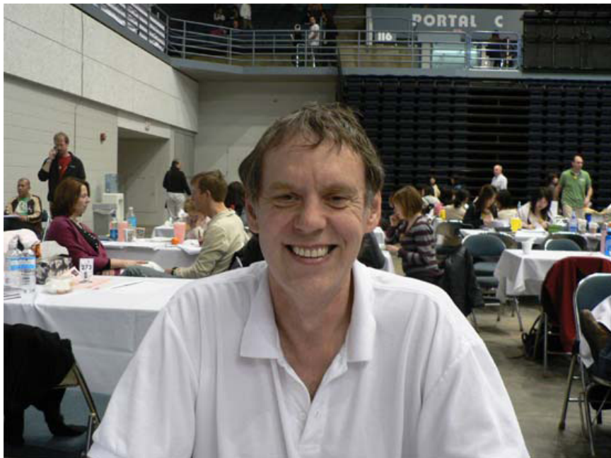
A bloke from Merrie Olde England 古老享樂英國來的巫師