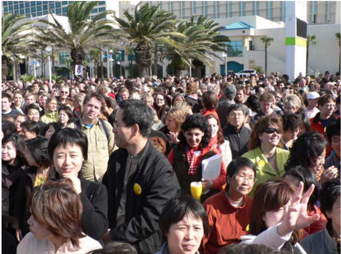
A Goodlie Crowde of Wizards converges from all over ye Worlde.全世界的智者來臨