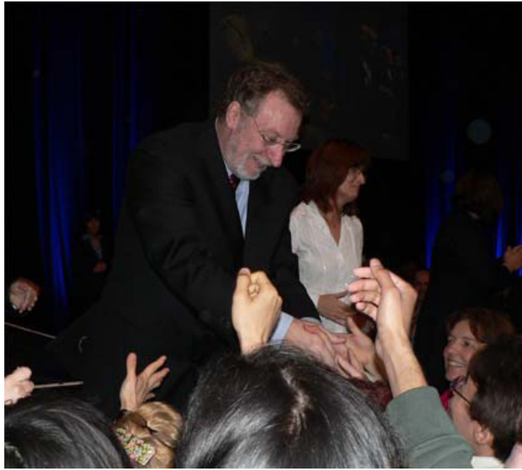
Harry congratulates the graduating Wizards.