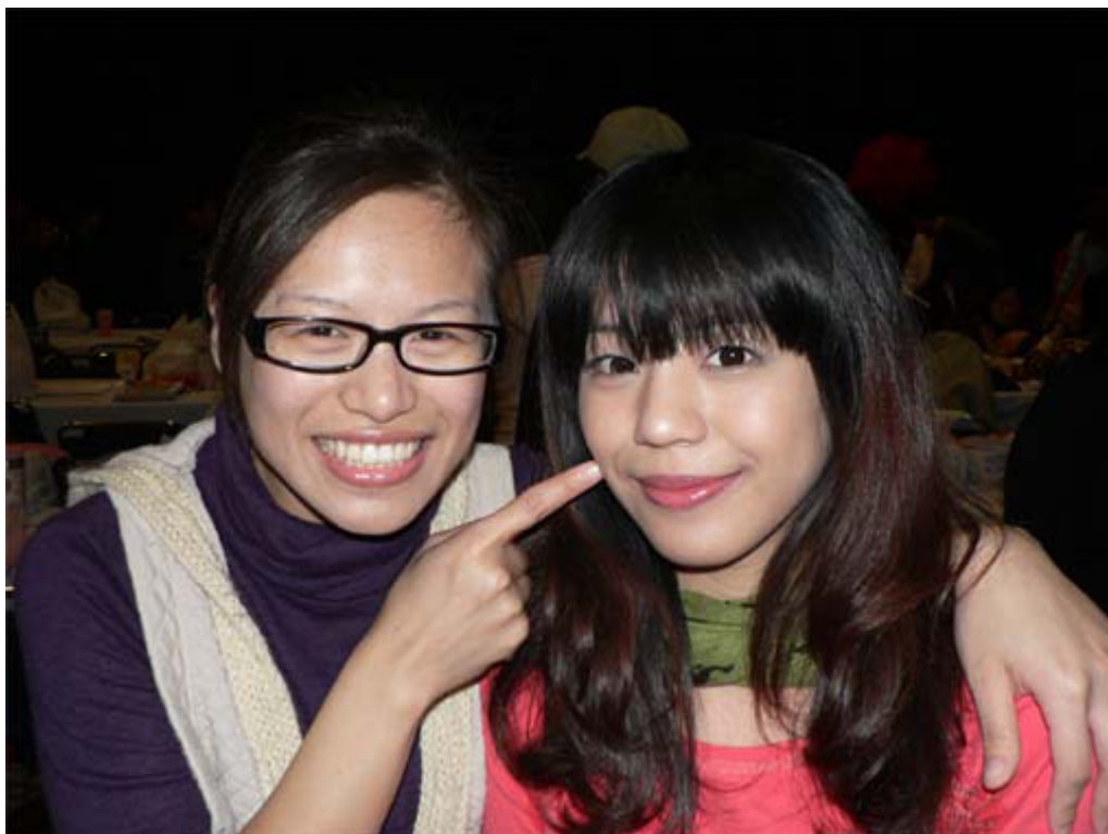
Ha ha! What dimension does she come from? 這位小姐從哪個次元來？