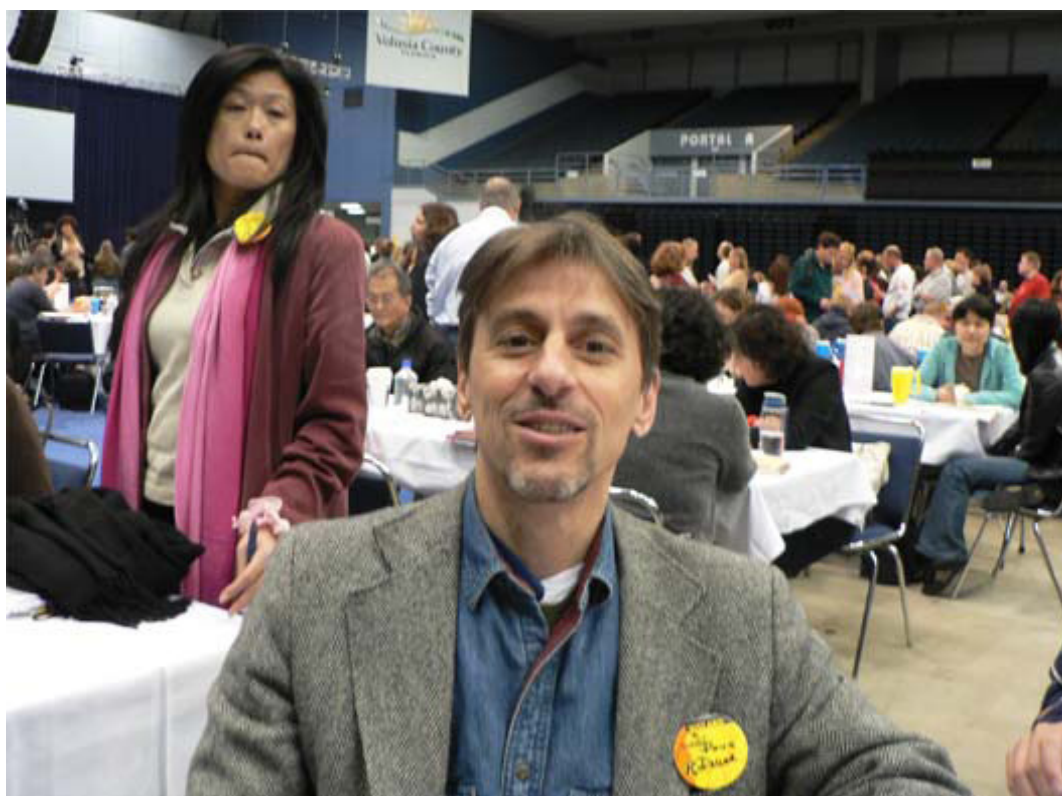
Veteran Wizards 舊的智者來幫忙鼓勵