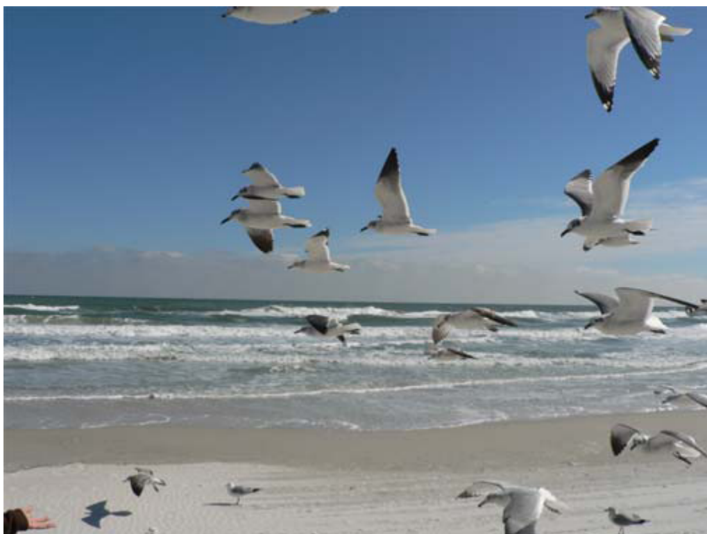
The Wizards fly home. 海鷗巫師飛回家