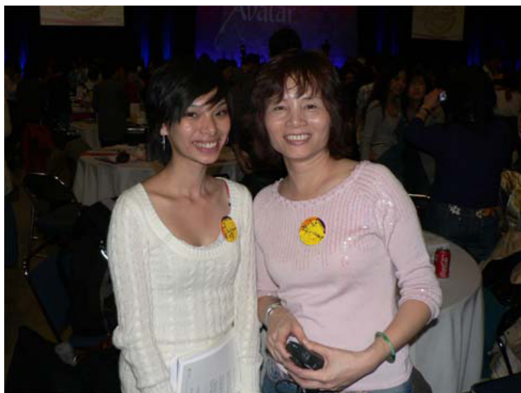
Bewitching Wizardesses from Taiwan.