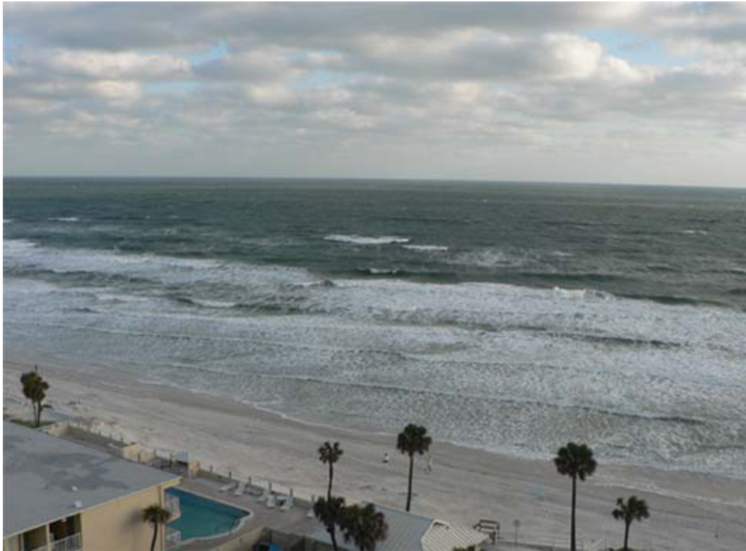
The Beach from our Room 德通海灘