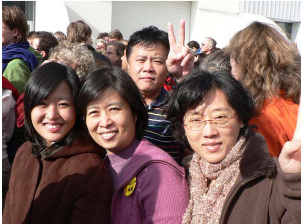
Faces from Taiwan 一些臺灣來的參與者