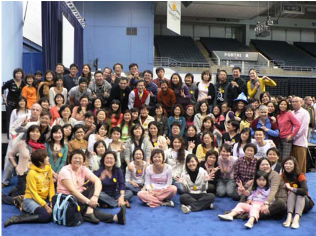
Our group of Wizards from Taiwan (about 80 or so). Almost 400 came from Japan and about 200 from Korea.

The largest group per national population was Holland. I think Taiwan was 2 nd .