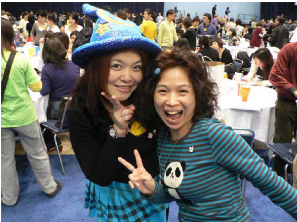
Yeah! You just graduated. 對，妳剛剛畢業了