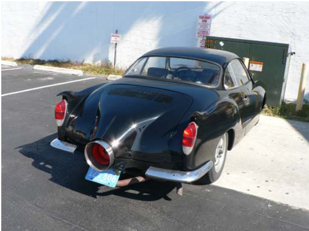
Batman stops for a burger before returning to the Bat Cave in his Batmobile