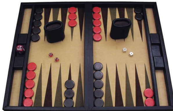
Modern Backgammon Board

If the game survived as Backgammon, we should take a look at a modern Backgammon board.