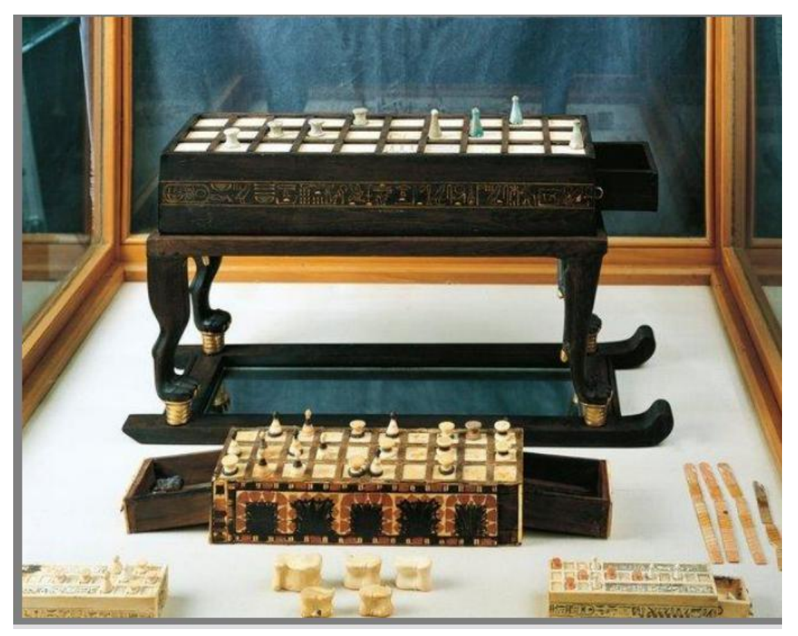
The four Senet Oracle Game Boards found in Tutankhamen's tomb. Notice the wooden throw sticks and the knucklebone dice used to calculate moves in the game or do readings in the oracle. The two

A box containing relics from the tomb of Tutankhamen. Notice the angel ladies protecting it. Above are Isis and Serget. Below are Neith and Nephtys.