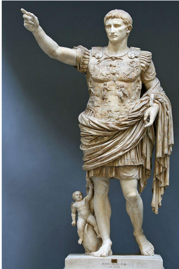
A statue of Octavian, Augustus Caesar, first Emperor of Rome