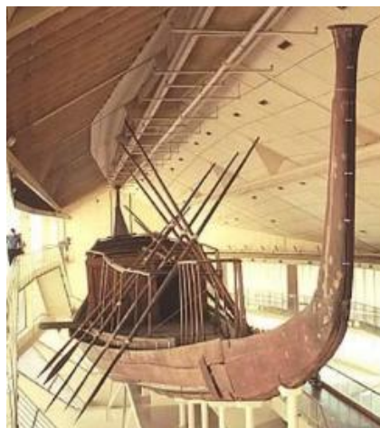
A Great Pyramid Solar Boat